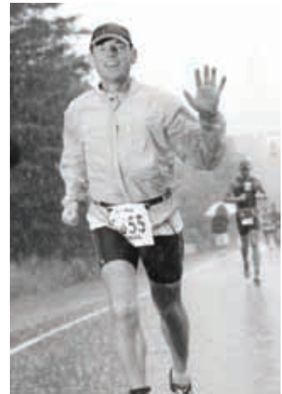
The Iron Friar